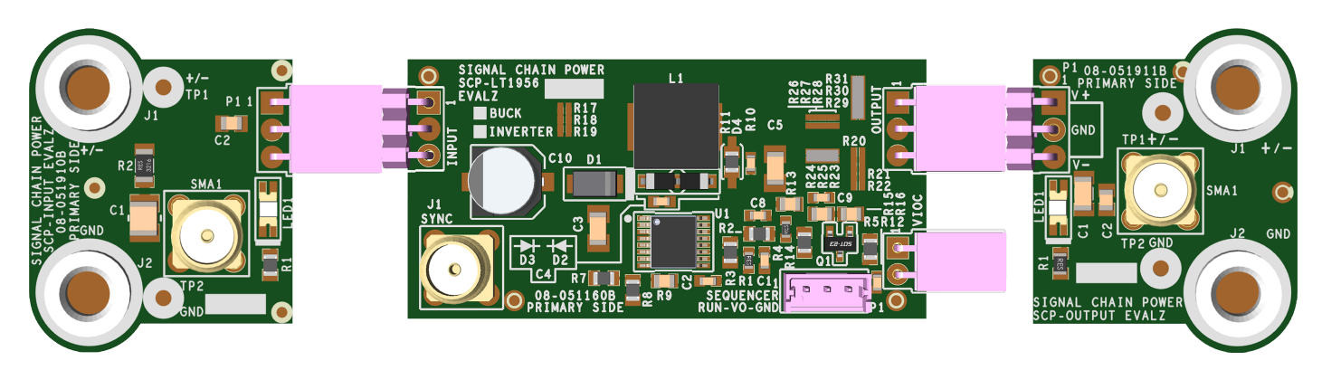
Figure 2. Proper Measurement Equipment Setup (Use SMA connectors for Measuring Input or Output Ripple)

NOTE: When measuring the input or output voltage ripple, use the optional SMA connector locations available on the input, output, 1\times 5 , 1\times 2 , and 5\times 1 breakout boards. Avoid using the test point connections with long scope leads.