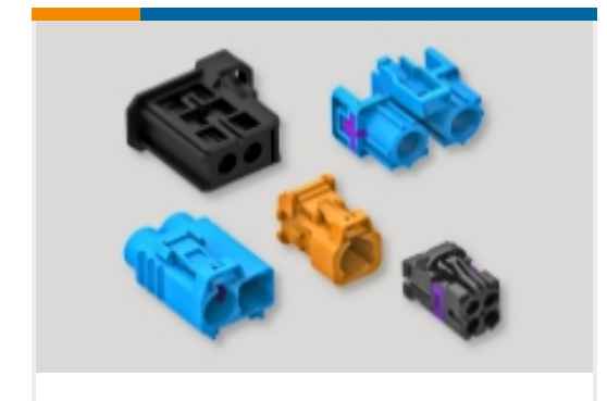
Data Connectivity Housings(18)