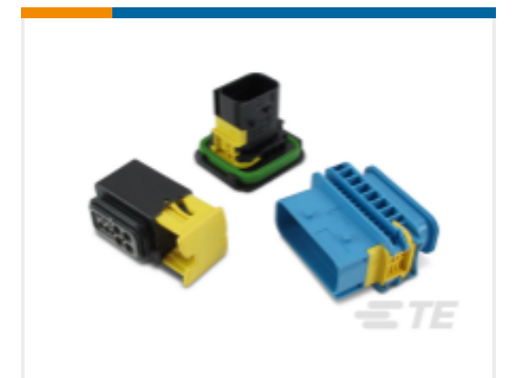
TE Part # CAT-H3399-CH8172 Heavy Duty Sealed Connector Series Housings