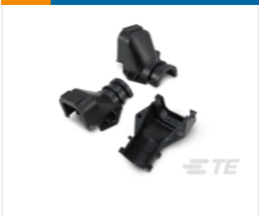
TE Part # CAT-H3399-B128 Heavy Duty Sealed Connector Series Backshells