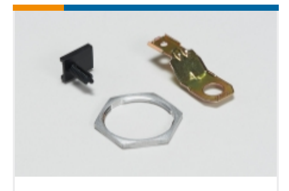
Other Automotive Connector Accessories(34)