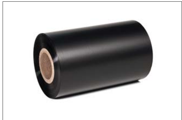
Ribbons for printing on adhesive labels.