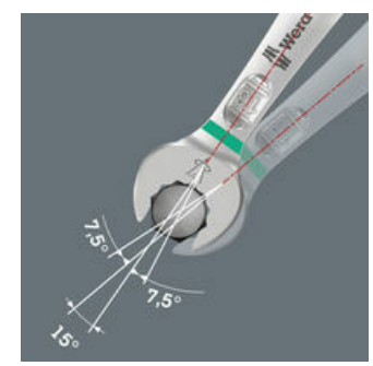
Joker 6003: For pivoting angles under 30°

Thanks to the mouth side pivoted by 7.5°, double hexagon geometry and an adjusted application method (placement - screwdriving - turning - replacement - screwdriving - turning, etc), even screwdriving challenges allowing a pivoting angle of less than 30° can be solved.