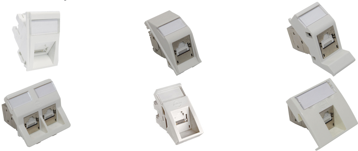
Top row, from left: MOD-Snap III module, Euromod II module, Contura module, Bottom row, from left: DIN module, 22.5 x 45mm module, 45 x 45mm module