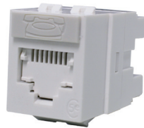
C5E and C6 UTP