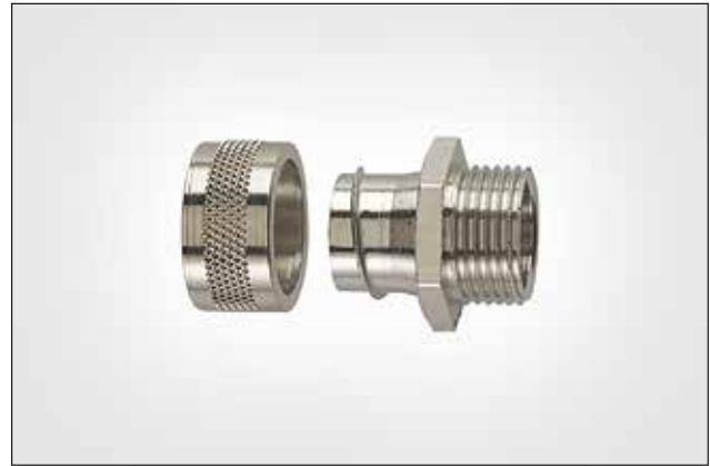
HelaGuard PCS-FM Fixed External Thread.

Fittings with PG and swivel threads are also available. For our complete range of conduits and fittings, please see our HelaGuard catalogue.