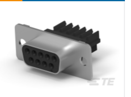
TE Part # CAT-AM7-248H8 IDC D-Sub: Receptacle Assembly, Wire to Wire, Signal, 2.74 mm