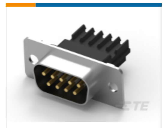
TE Part # CAT-AM7-248H3 IDC D-Sub: Plug Assembly, Wire to Wire, Signal, 2.77 mm