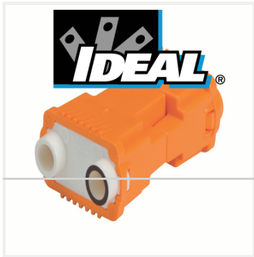
PowerPlug® Luminaire Disconnect, Model 102, 2-Wire, Jar of 75