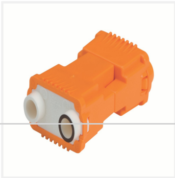
PowerPlug® Luminaire Disconnect, Model 102, 2-Wire, Box of 1,000