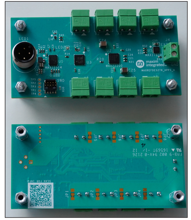
Figure 1. MAXREFDES278# IO-Link Octal Solenoid Driver.

IO-Link is the first open, field bus agnostic, low-cost, point-to-point serial communication protocol used for communicating with sensors and actuators that has been