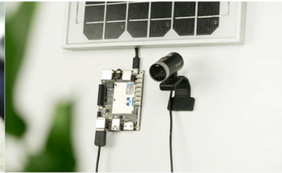
SECURITY MONITORING WITH FACIAL RECOGNITION