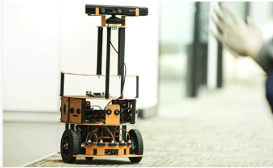
A POWERFUL BRAIN FOR A ROBOT