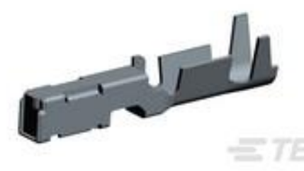
TE Part #1924955-4 CONTACT, FEMALE 0.64, 18AWG, UNSEALED