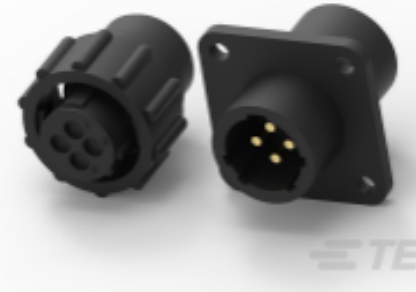
TE Part #213860-1 Cable/Panel Mount Connector, CPC Series 1