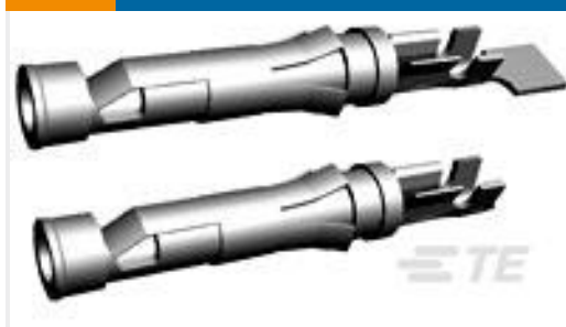
TE Part #66109-4 III+ SKT, 26-24, 30AU/FL, LP