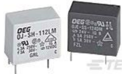
TE Part #1461404-1 OJ-SH-105LM, 000