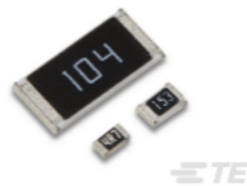
TE Part #2-2176349-4 CRGCQ 2512 820R 1%