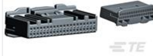
TE Part #1379671-1 40W PLUG HSG ASSY BLACK