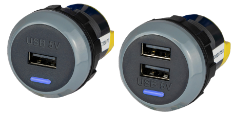
PowerVerter PV65R-S and PV65R-D single and double outlets.