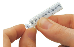
Separating an individual marker from the WMB marker strip – for larger terminal blocks.