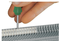
Snapping a WMB marker strip into the marker slot of the double marker carrier.