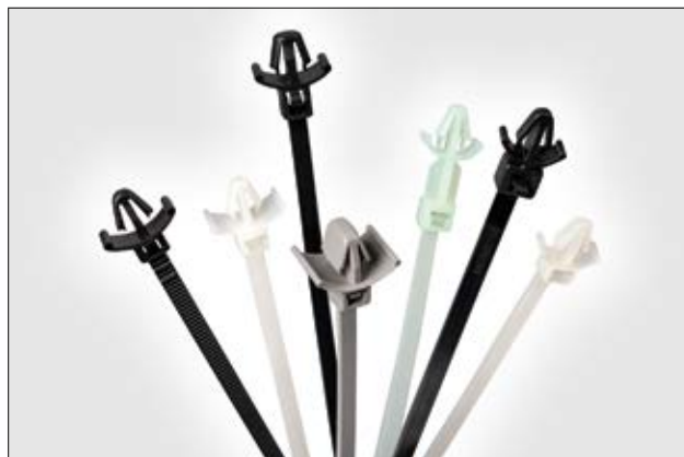
A wide range of arrowhead fixing ties which are suitable for different panel thicknesses and hole diameters.