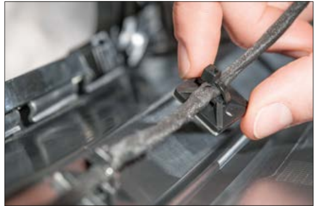
SolidTack MB Series mounts with square design - screwable, self-adhesive - suitable for a wide range of applications like fastening of cables in the automotive machinery.