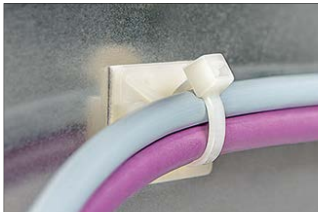
TY-Series mounts with rectangle design.