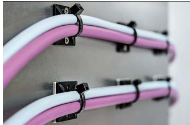
MB-Series Mounts with square design / screwable, self adhesive.