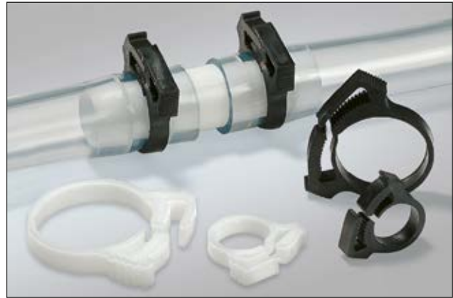
SNP - Snapper Hose Clips range.