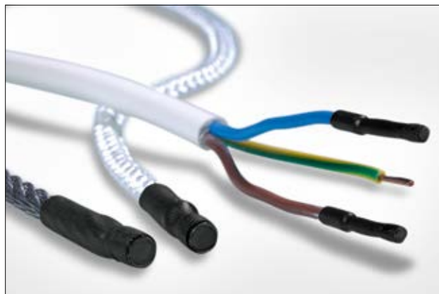
The appropriate end cap for every cable diameter, and cable types.