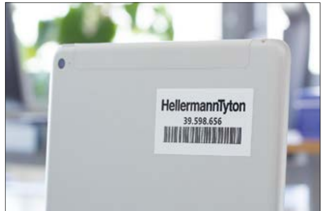
Helatag label for permanent asset identification.