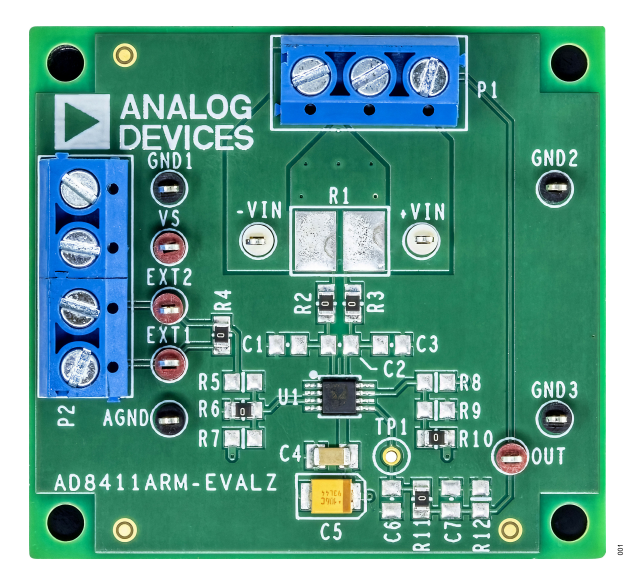
Figure 1. AD8411ARM-EVALZ Top View