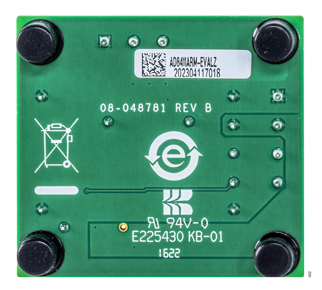
Figure 2. AD8411ARM-EVALZ Bottom View