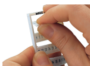
Separating a strip from the WMB or WMB marker card.