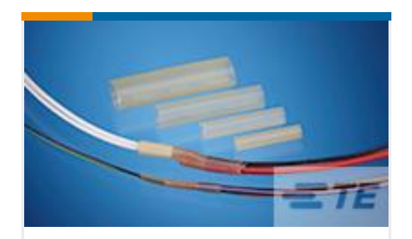
TE Part #CB88166002 RBK-VWS-125-NR1-X-100MM