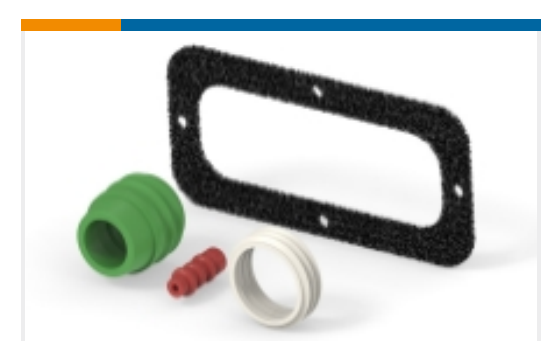
Connector Seals & Cavity Plugs(27)