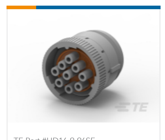
TE Part #HD16-9-96SE PLUG ASM