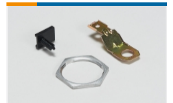
Other Automotive Connector Accessories(14)