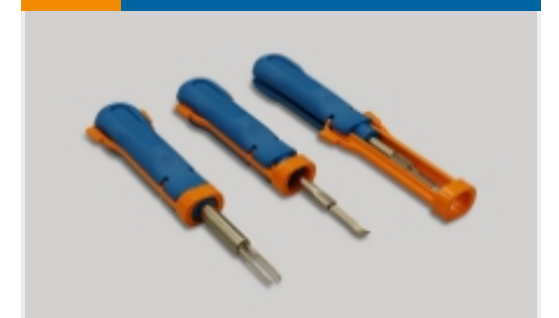
Insertion & Extraction Tools(42)