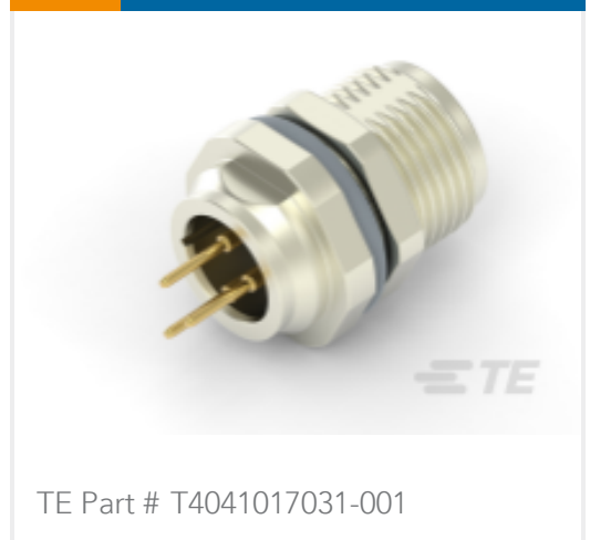
M8 REAR MOUNT, FEMALE, 3P, SOLDER PCB