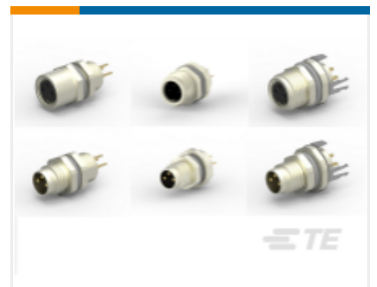
TE Part # CAT-C73765-M1C M8 Panel Mount PCB