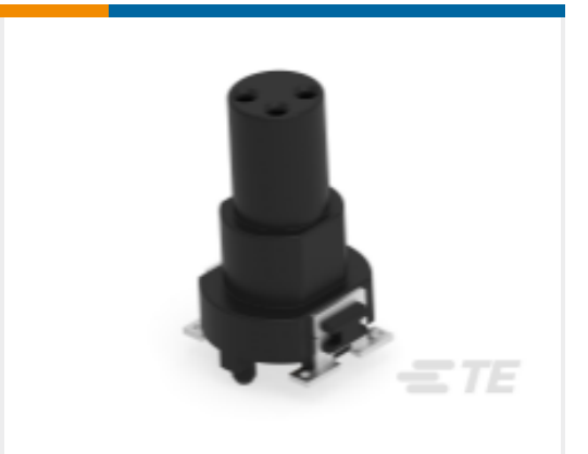
TE Part # 464431-E M08 F 3 A H S * 301 16,3 094 * * * V 000