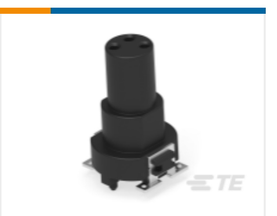
TE Part # 464643-E M08 F 3 A H S * 207 16,3 094 * * * * 999