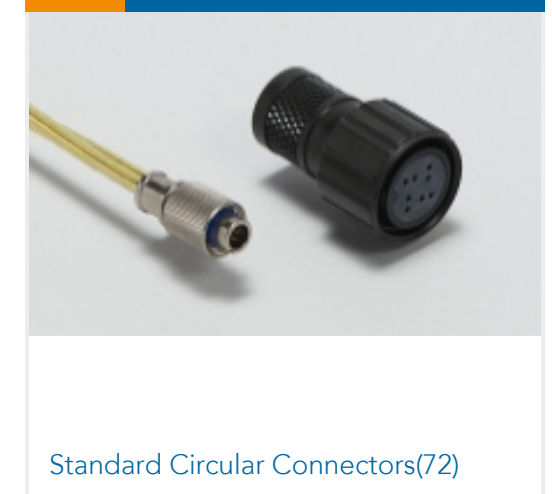
Customers Also Bought