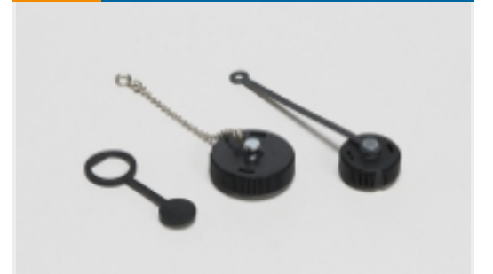
Circular Connector Caps & Covers(16) Circular Connector Hardware(3)