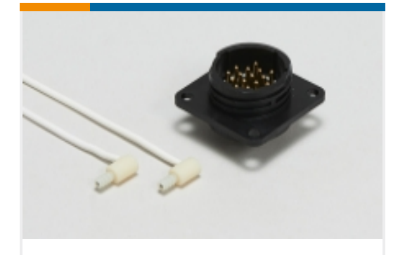
Circular Power Connectors(458)