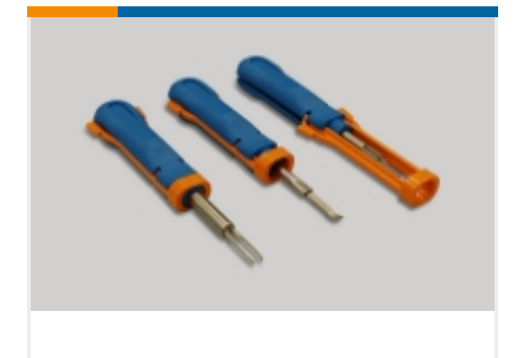
Insertion & Extraction Tools(1)