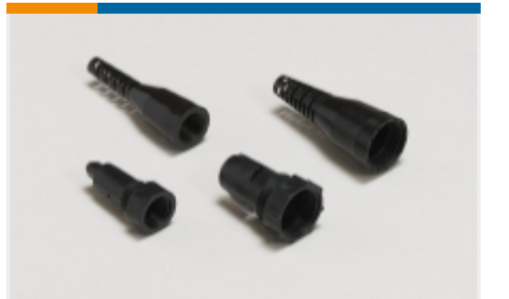
Connector Strain Relief(6)