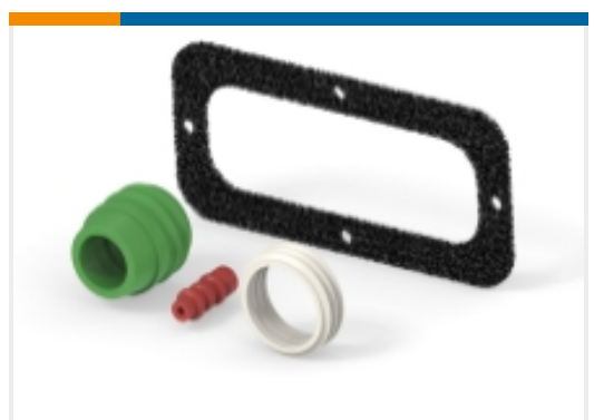
Connector Seals & Cavity Plugs(36)