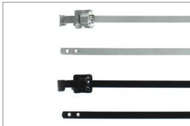
MLT-Series. Releasable stainless steel buckle tie with and without coating.

i The MLT-Series (up to 10 mm) can be used in combination with the stainless steel P-Mount. The mount is simple to install with a screw or bolt and ensures a durable fixing solution. Please see page 173.