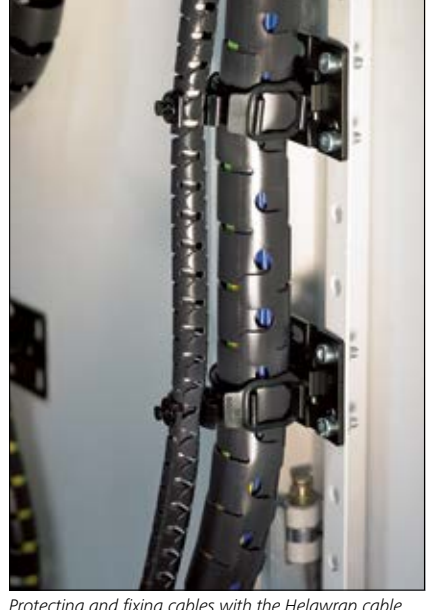
Protecting and fixing cables with the Helawrap cable cover and accessory set, for instance in wiring cabinets.