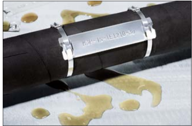
Identification for hazardous environments: M-BOSS Compact stainless steel markers.