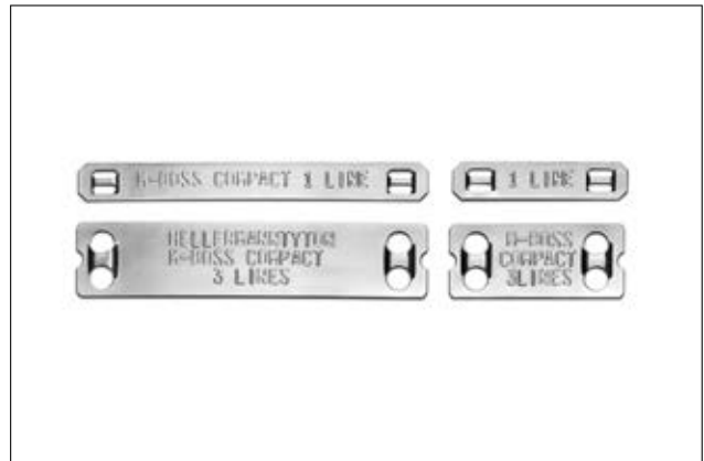
A range of metal plate sizes to suit your needs.