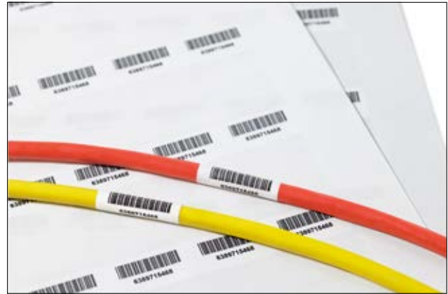
Laminating the mark gives long-term print survivability.

A specially developed material for use in labels required to wrap around cables and wires. The structure of the label ensures that once the label is applied to the wire it remains in place without lifting. The rounded edge construction gives additional bonding features not found in straight edge label designs. The information is printed onto the white inscription area. The printed information area is placed onto the wire and the transparent tail is wrapped around the wire and covers the text; this gives excellent protection from abrasion, dust and debris. TagPrint Pro labelling program comes pre-loaded with all our labels. Designing labels is simply done; just choose inbuilt graphics or download your own and add data from ERP system or standard office programs such as Excel. Barcodes are created in a couple of clicks.