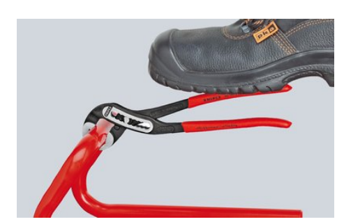
Self-locking on pipes and nuts: no slipping on the workpiece; the complete actuating force can be used to turn the workpieces; not having to squeeze the pliers handles reduces the required effort