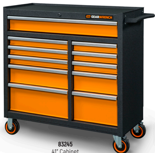
83245 41" Cabinet