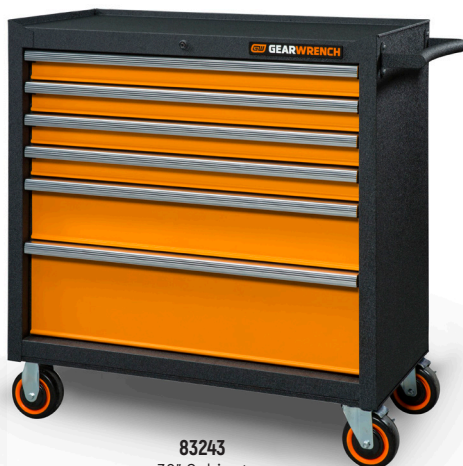
83243 36" Cabinet