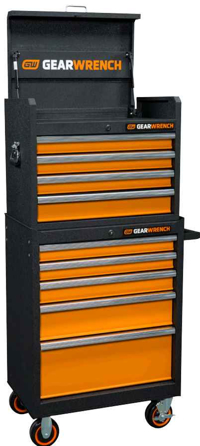
26" Chest and Cabinet Combination