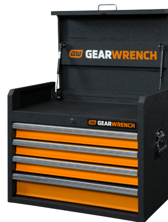
83240 26" Chest