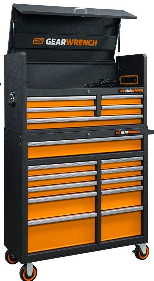
41" Chest and Cabinet Combination