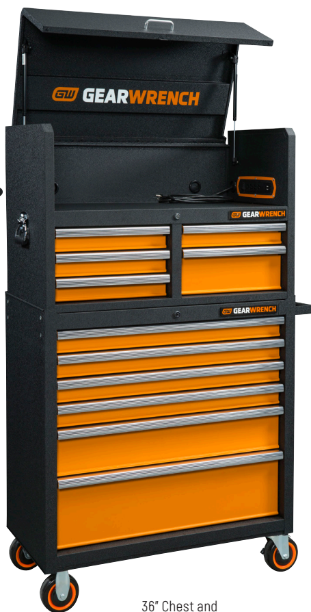
36" Chest and Cabinet Combination