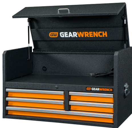
83244 41" Chest