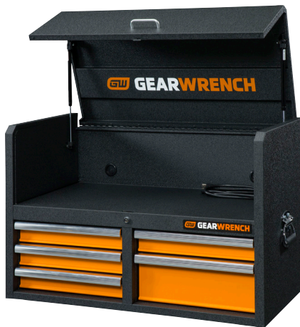
83242 36" Chest