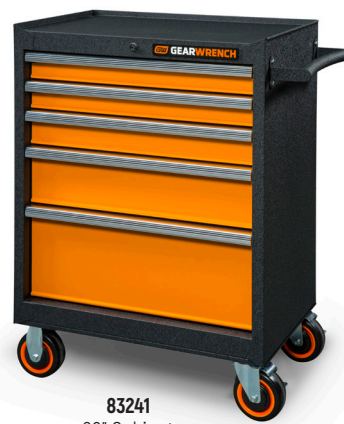
83241 26" Cabinet