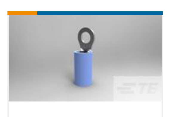
TE Part #326882 TERMINAL, PIDG R 16-14 6