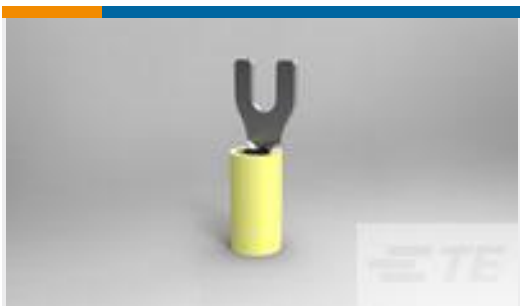
TE Part #8-35152-2 TERMINAL,PIDG SPD 12-10 8