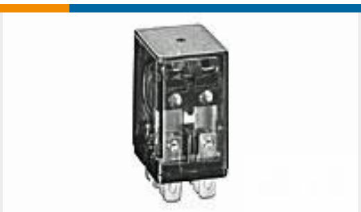
TE Part #4-1393144-1 K10P-11A15-24=K10/K20