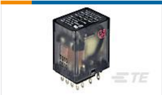
TE Part #2-1393122-6 KHAU-17A11N-120=KH