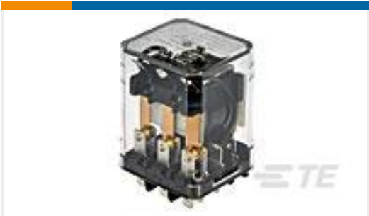
TE Part #2-1393117-2 KUP-11A15-240=KU