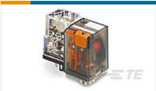
TE Part #4-1393104-9 KRPA-11DN-110=KRPA