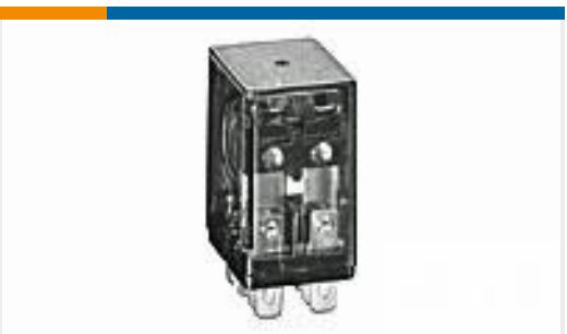
TE Part #5-1393144-5 K10P-11D15-12=K10/K20