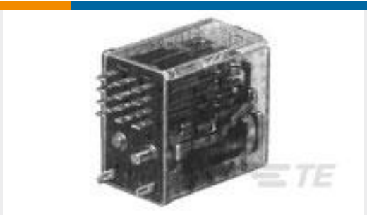
TE Part #3-1393766-8 R10-E1Y2-S800=R10