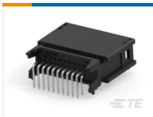
TE Part #2208165-1 20POS,NANO MQS,HEADER ASSY, CODA