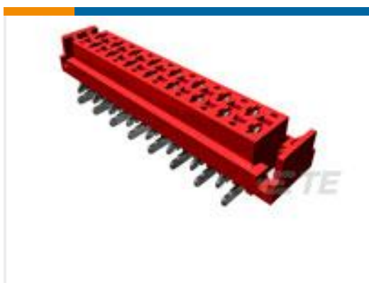
TE Part #2-338069-0 MICRO-MATCH SMD FTE