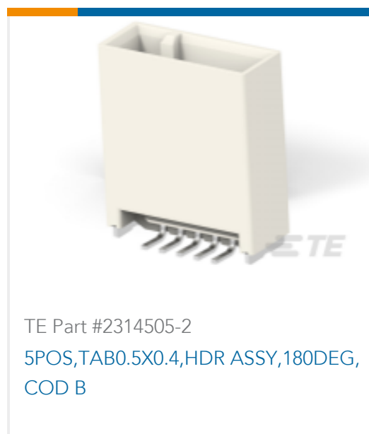
TE Part #2314505-2 5POS,TAB0.5X0.4,HDR ASSY,180DEG, COD B