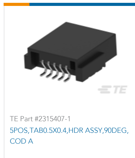
TE Part #2315407-1 5POS,TAB0.5X0.4,HDR ASSY,90DEG, COD A