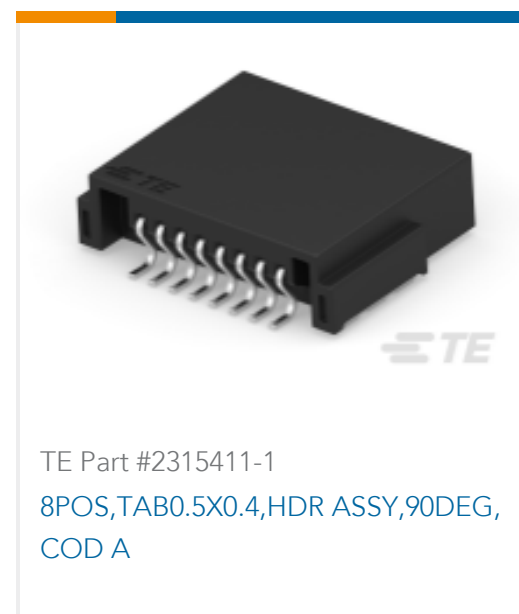
TE Part #2315411-1 8POS,TAB0.5X0.4,HDR ASSY,90DEG, COD A