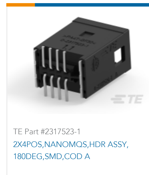
TE Part #2317523-1 2X4POS,NANOMQS,HDR ASSY, 180DEG,SMD,COD A