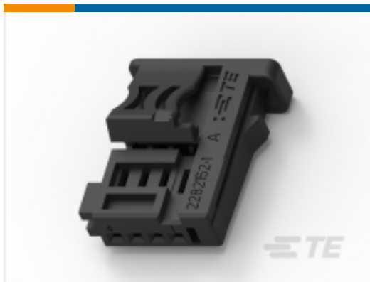
TE Part # 2282152-1 4POS,NANOMQS,REC HSG,CODA