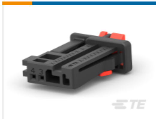
TE Part # 2333102-1 2POS,NANOMQS,REC HSG ASSY, COD A