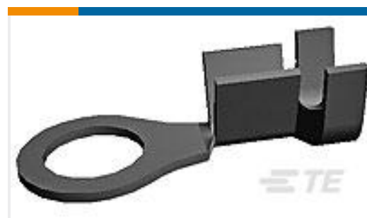
TE Part #626033-2 RING TONGUE 1.0-2.5 MM2 0.60X11.43 TPBR