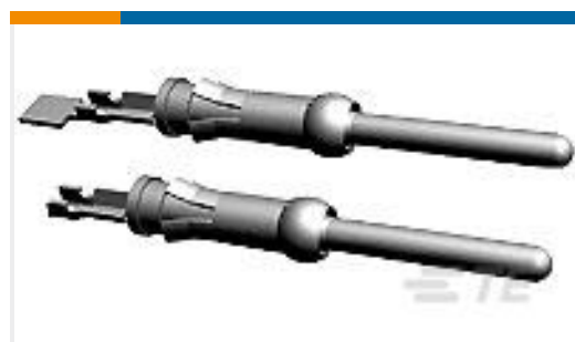
TE Part #1-66103-9 III+ PIN,24-20,TIN,SMPACK