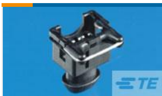
TE Part #282729-1 SPLASH PROOF CONN. ASS'Y