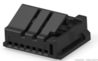
TE Part # 1-2301968-1 7POS,PICO MQS,REC HSG,UNSLD