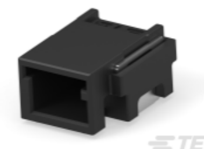
TE Part #1-2339210-0 PicoMQS, 2-22 POS HDR ASSY, Unsealed