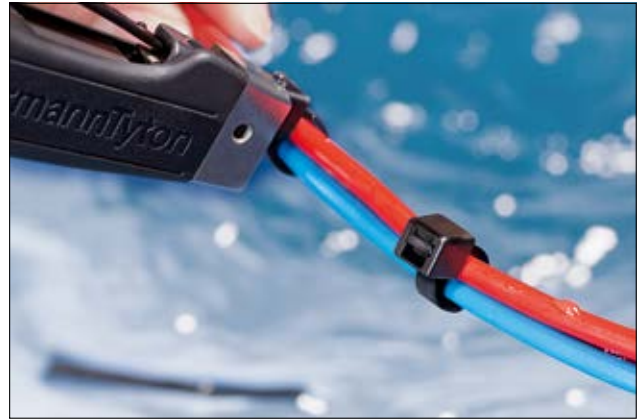
T-Series cable ties for higher chemical resistance and temperatures up to +115 °C (PP).