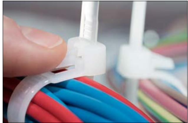
Releasable and reusable cable tie, REL-Series.