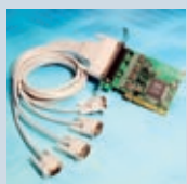
UC-268: uPCI 4xRS232