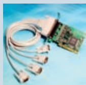
UC-265 uPCI 4xRS232 DB25