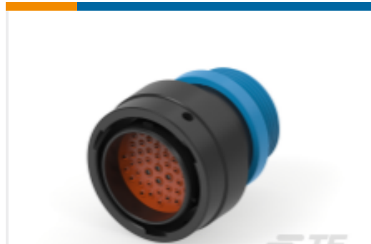
TE Part #HDP26-24-47PE-L015 PLG, 47P, BLK, E, THD, 16/20, P