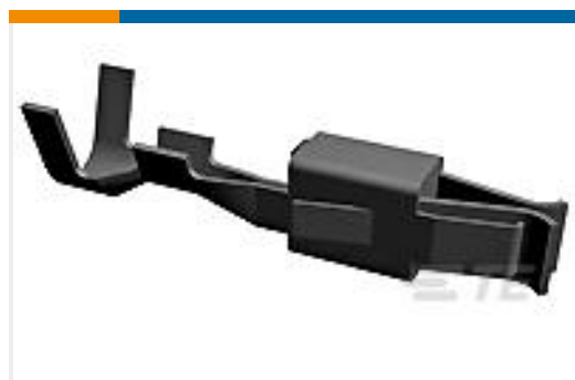
TE Part #929938-1 JPT REC 2.8 Contact SWS Sn (LP)