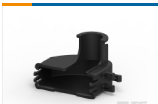
TE Part #1452317-1 COVER F.16P JPT HSG