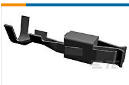
TE Part #929942-1 JUN-POW-TIM KONTAKT