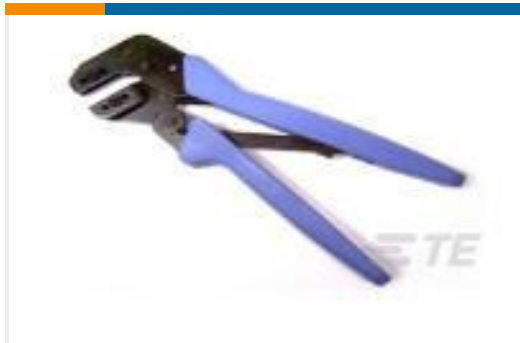
TE Part #90760-1 PROCRIMP TL W/DIE MIN UNIV MNL