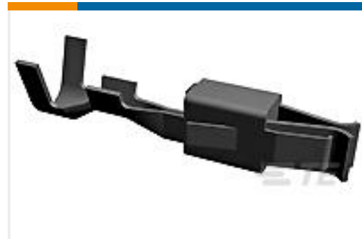
TE Part #1-929939-1 JPT REC 2.8 Contact SWS Au