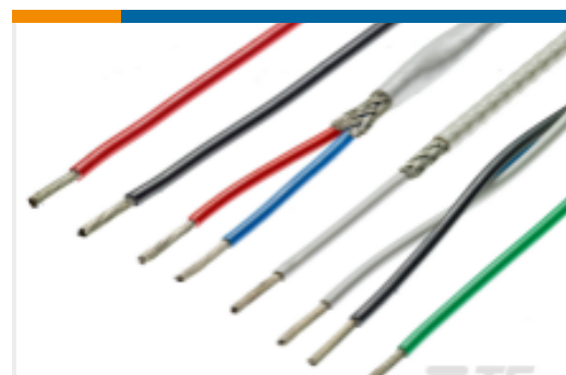
TE Part #4624693002 FLHTC0311-26-7