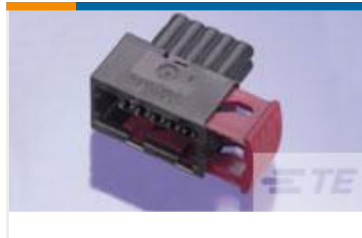
TE Part #1-967242-1 JPT GEH KPL 16P