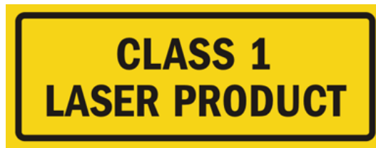
Figure 1. Class 1 laser product label

The Time-of-Flight and gesture-detection sensor contains a laser emitter and the corresponding drive circuitry. The laser output is designed to remain within Class 1 laser safety limits under all reasonably foreseeable conditions including single faults in compliance with IEC 60825-1:2014 (third edition). The laser output remains within Class 1 limits as long as the STMicroelectronics recommended device settings are used and the operating conditions specified in their datasheets are respected. The laser output power must not be increased by any means and no optics used to focus the laser beam. Figure 1 shows the warning label for Class 1 laser products.