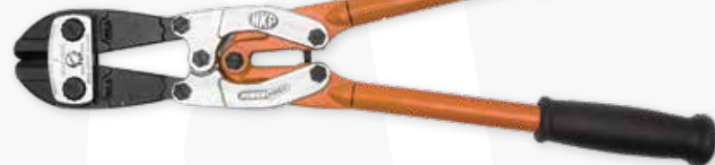
0190MCP 24" PowerPivot™ Bolt Cutter