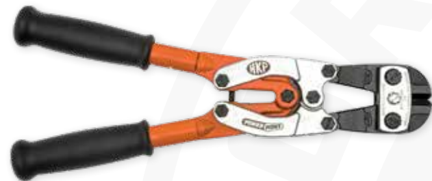
1490MCP 14" PowerPivot™ Bolt Cutter

The unique PowerPivot™ geometry was developed using advanced computer-aided design to create a double compound action system with greater efficiency than competitive bolt cutters. Together with specially engineered HKP blades, PowerPivot™ bolt cutters deliver superior strength with a 30% reduction in effort to cut when cutting 7/16" HRC-31, 3/8" HRC-42, and 5/16" HRC-48.