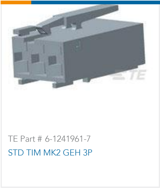
TE Part # 6-1241961-7 STD TIM MK2 GEH 3P