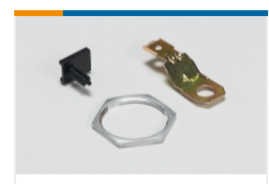
Other Automotive Connector Accessories(27)