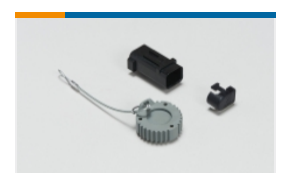
Automotive Connector Caps & Covers (19)