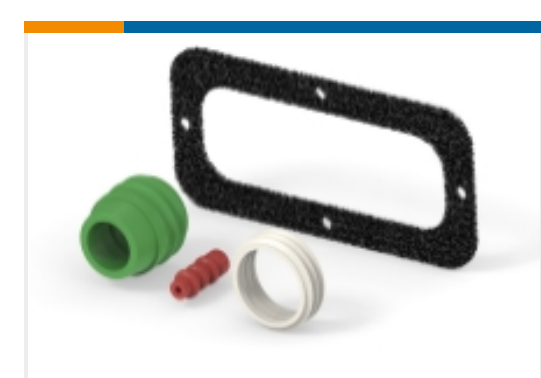
Connector Seals & Cavity Plugs(6)