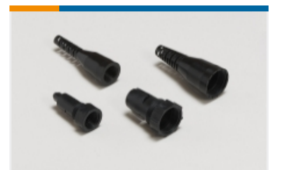
Connector Strain Relief(28)