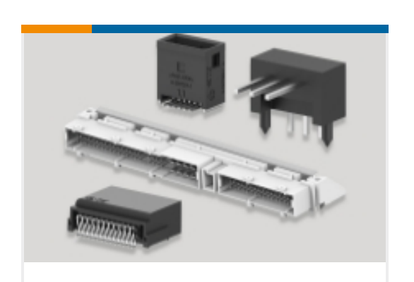
PCB Headers & Receptacles(103)