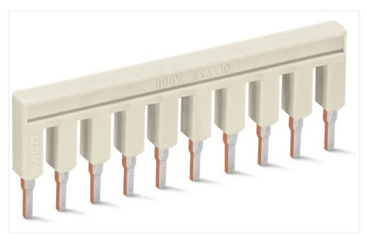
Color: ■ light gray