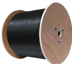
75 OHM RG-59/U COAXIAL CABLE