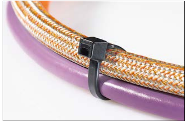
LK-Series – in-between size to T-Series.