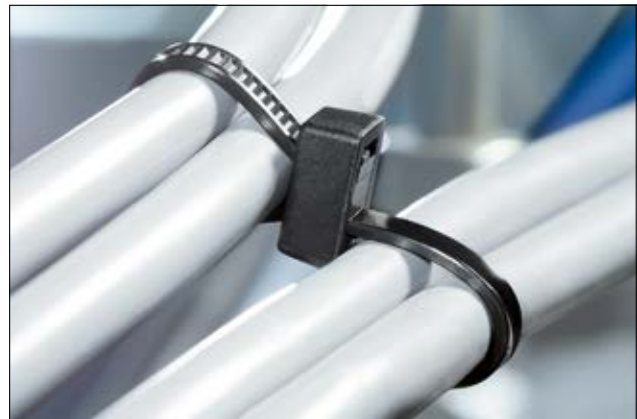
DH-Series cable ties for parallel routing.