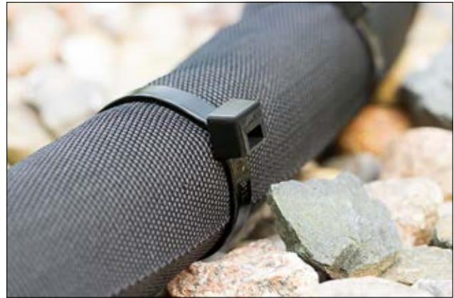
Impact resistant T-Series cable tie (PA66HIR(S)).